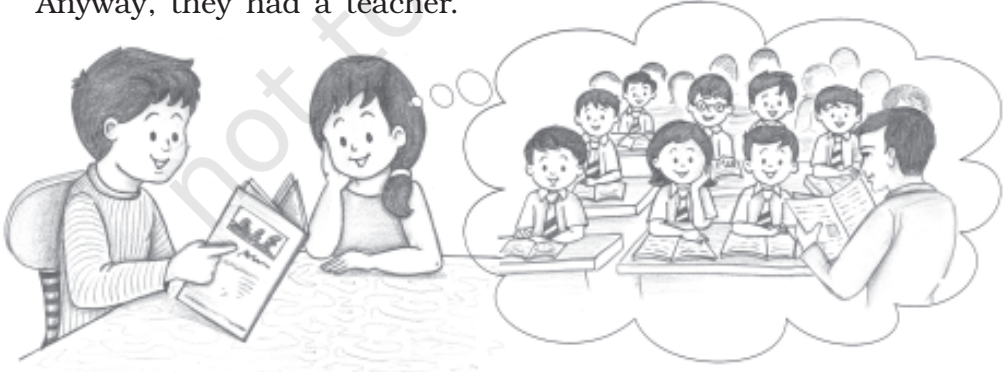
They had a teacher... It was a man.