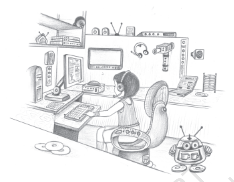
The mechanical teacher was flashing on the screen...

because her mother said little girls learned better if they learned at regular hours.